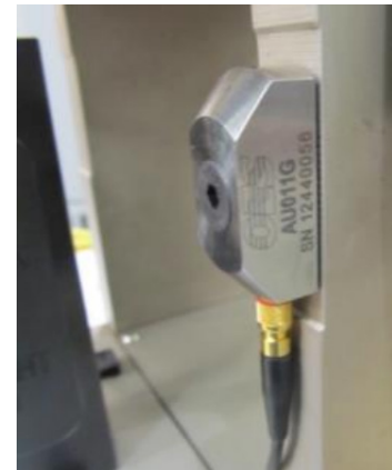
Typical Piezo Strain Sensor Mounting locations – Steel Frame and Cast Iron Frame Presses

OES Strain Sensor was introduced by OES for crimp force monitoring applications. Now widely adopted by the wire processing industry as a proven and effective sensor for assurance of crimp quality.