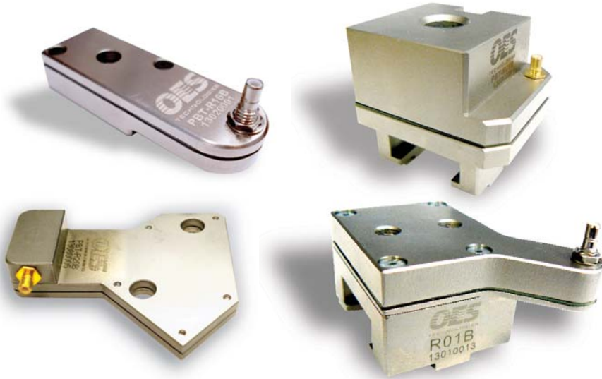
SenFit Ram Adapter Models

Highly responsive sensors custom fit for even the most challenging crimp force monitoring applications